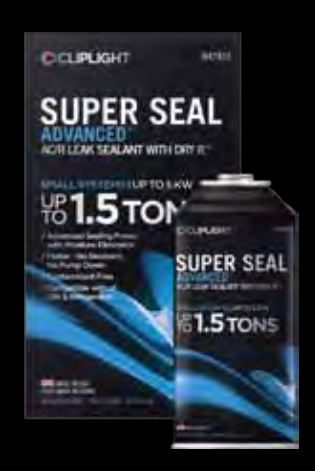
947KIT* SMALL SYSTEMS UP TO 1.5 TONS | 5 KW