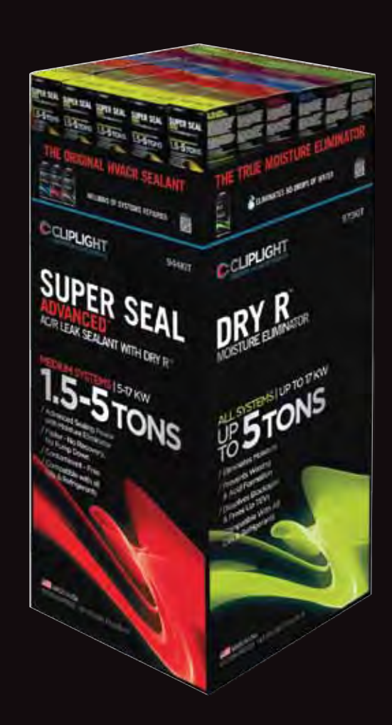
30 PACK FLOOR DISPLAY