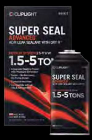
944KIT* MEDIUM SYSTEMS 1.5-5 TONS | 5-17KW