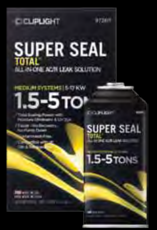
972KIT* MEDIUM SYSTEMS 1.5-5 TONS | 5-17KW APPLY SECOND CAN FOR SYSTEMS 5+ TONS | 17+ KW