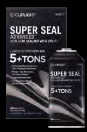
948 KIT * LARGE SYSTEMS 5+ TONS | 17+ KW