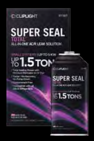
971KIT * SMALL SYSTEMS UP TO 1.5 TONS | 5 KW