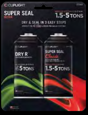
979KIT* MEDIUM SYSTEMS – 1.5-5 TONS | 5-17KW