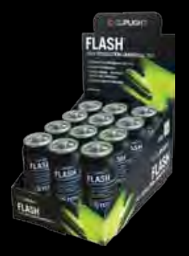
ALL PRODUCT IS SHIPPED IN CONVENIENT 12 PACK DISPLAY