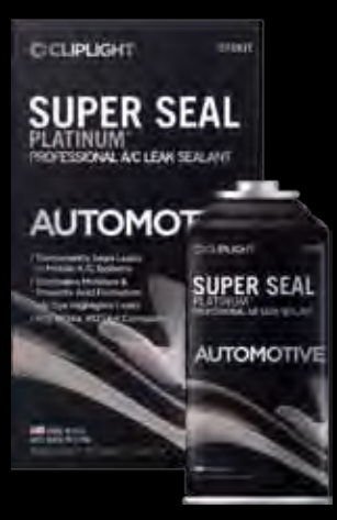
976KIT* ALL AUTOMOTIVE SYSTEMS

20125*: R134a to R12 conversion valve sold separately