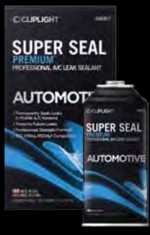
946KIT* ALL AUTOMOTIVE SYSTEMS

20125*: R134a to R12 conversion valve sold separately