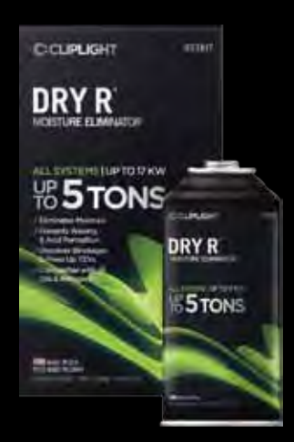
973KIT* ALL SYSTEMS – UP TO 5 TONS | 17KW APPLY SECOND CAN FOR SYSTEMS 5+ TONS | 17+ KW

/ Dissolves Blockages & Frees Up TEVs / Compatible with all Oils & Refrigerants